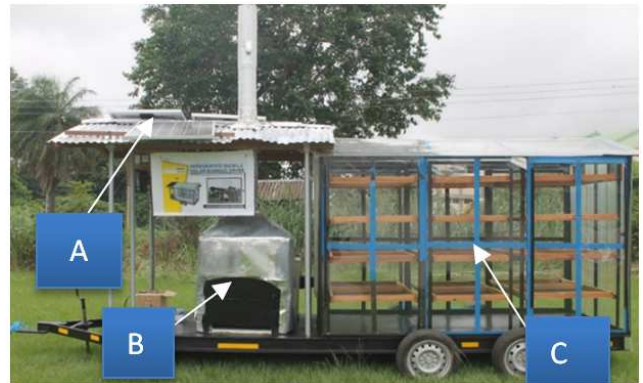
Figure 1. Developed mobile solar biomass hybrid dryer with Solar PV system. A – Solar PV unit; B – Furnace with enclosed heat exchanger and chimney; C – Drying chamber with drying racks.

drying grains in the dryer. In communities with no electricity access, the installed PV system with backup batteries provides electricity to support the dryer operation.