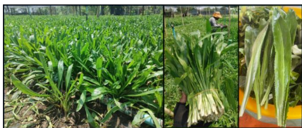
Figure 2. Growth Stages and Harvest of Long Coriander (Source: Authors, 2024).